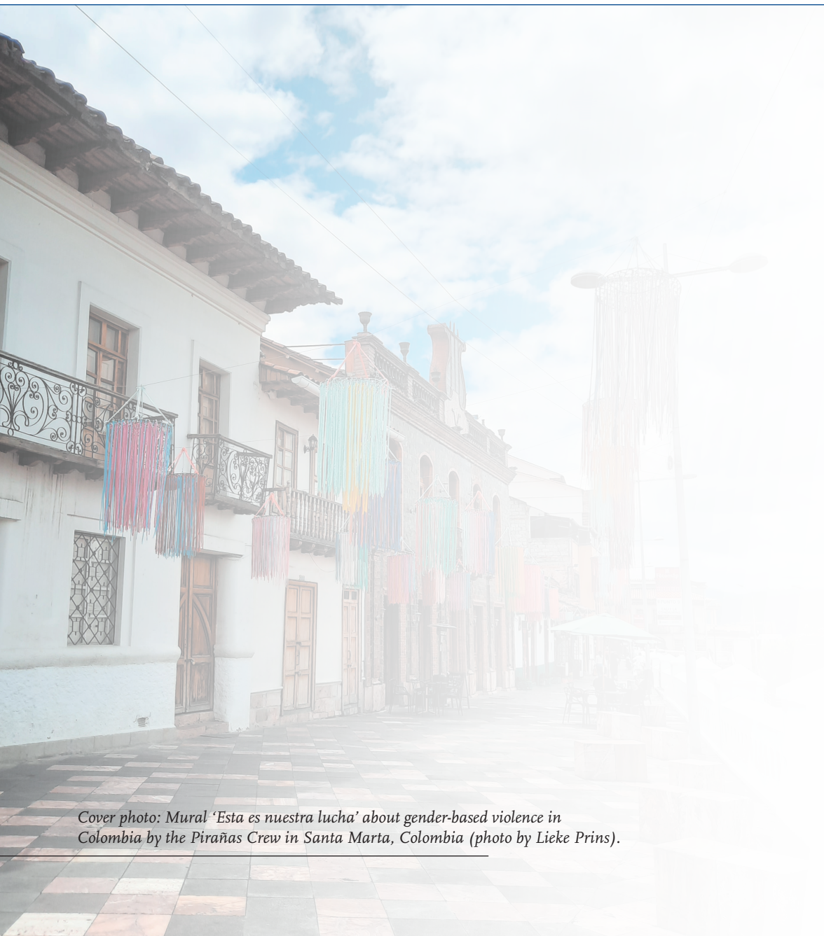
Cover photo: Mural 'Esta es nuestra lucha' about gender-based violence in Colombia by the Pirañas Crew in Santa Marta, Colombia.