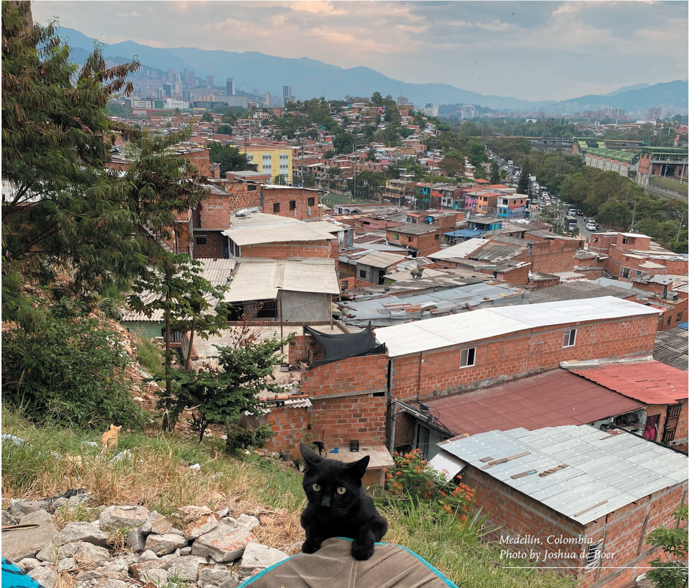
Medellín, Colombia