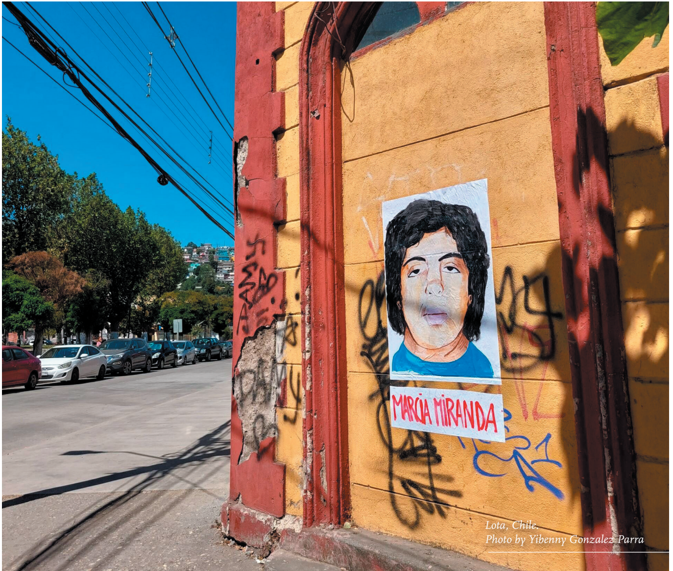
Lota, Chile.