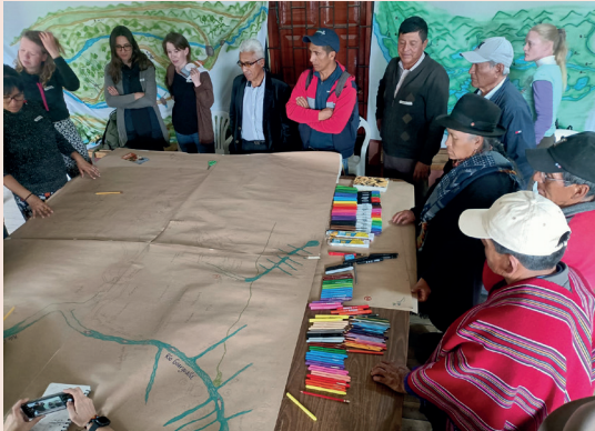
Participants arrived from all corners and provinces of the country to participate in the forum and workshops.